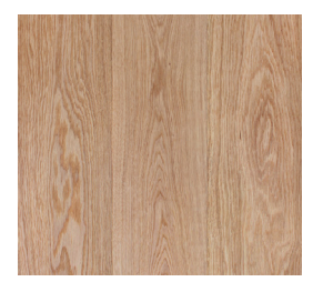
Natural Oak Light Feature