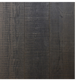
Loft White Ebony