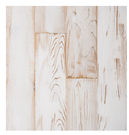
White Distressed Spruce Panelling

White Distressed Spruce Engineered T&G panelling by Forté. 17mm thick, 150mm wide and 1000/1200/2200mm lengths. Glue and pin installation method onto substrate. Pre-finished with water-based paint