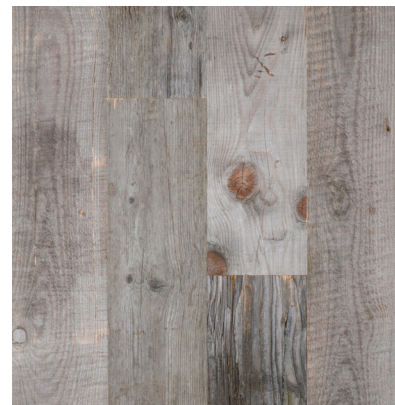
Silvered Spruce Panelling

Salvare Silvered Spruce Engineered T&G panelling by Forté. 17mm thick, 150mm wide and 1000/1200/2200mm lengths. Glue and pin installation method onto substrate. Unfinished.