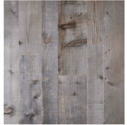
Silvered Spruce Lamella

Salvare Silvered Spruce Lamella by Forté. 7mm thick, mixed width and length. Glue and pin installation method onto substrate. Butt joint profile. Unfinished.