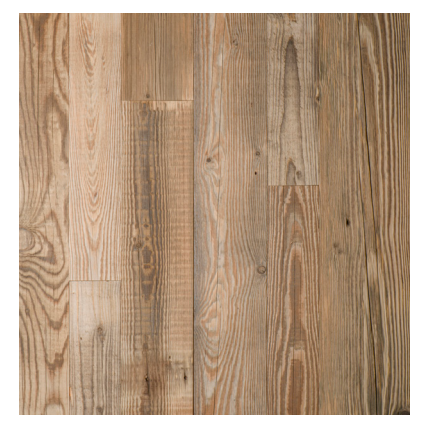
Natural Spruce Lamella

Salvare Natural Spruce Lamella by Forté. 7mm thick, mixed width and length. Glue and pin installation method onto substrate. Butt joint profile. Unfinished.