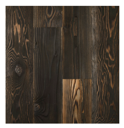
Charred Spruce Panelling

Salvare Charred Spruce Engineered T&G panelling by Forté. 17mm thick, 150mm wide and 1000/1200/2200mm lengths. Glue and pin installation method onto substrate. Pre-finished with Rubio Oil.