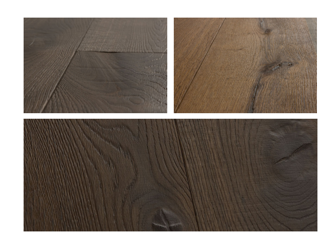
SMOKED EUROPEAN OAK

Smoked or fumed timber has been treated to alter the colour depth and tonal variation of the wood. To find out more, visit <a href="mailto:forte.co.nz/advice/what-is-smoked-timber">forte.co.nz/advice/what-is-smoked-timber</a>