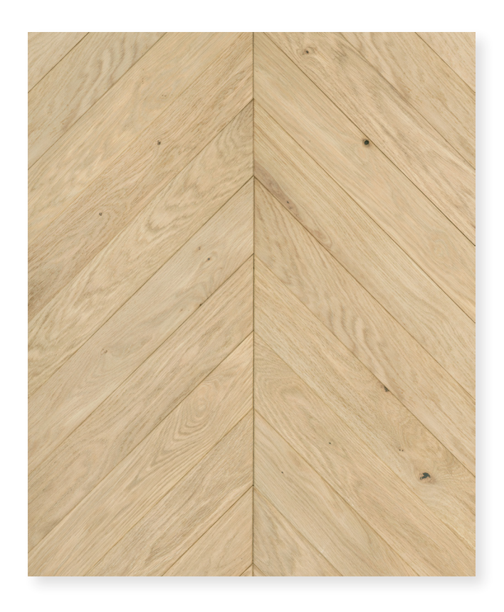
CHEVRON 45 Degrees