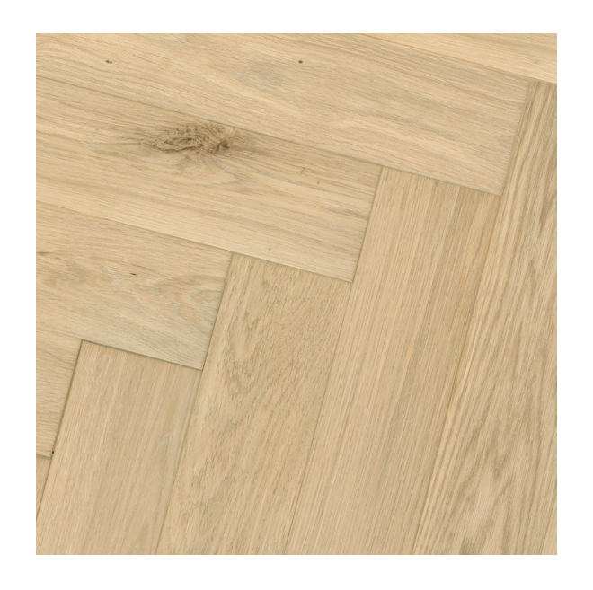
Plank is tongue and groove on all four sides. Product supplied in right and left planks.